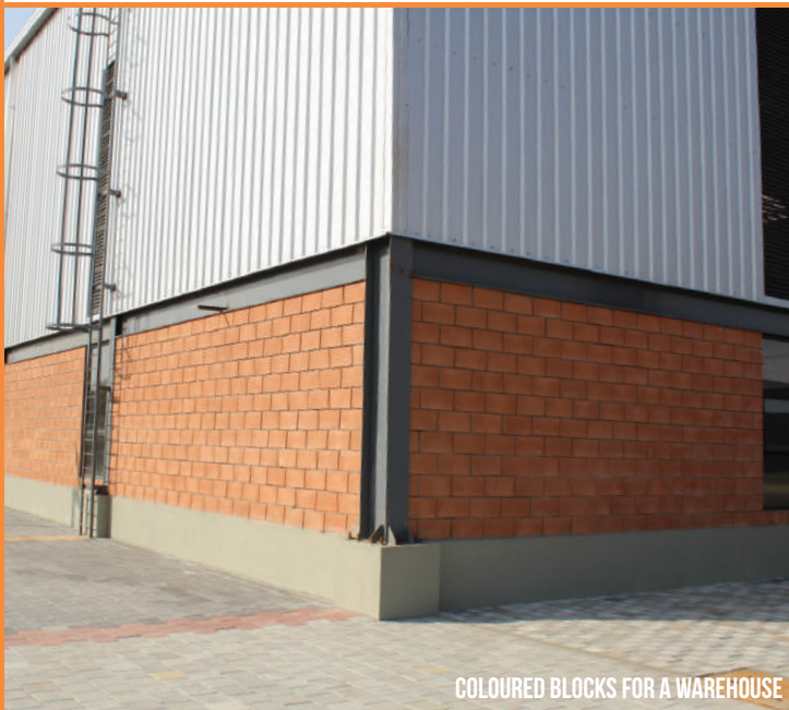
COLOURED BLOCKS FOR A WAREHOUSE