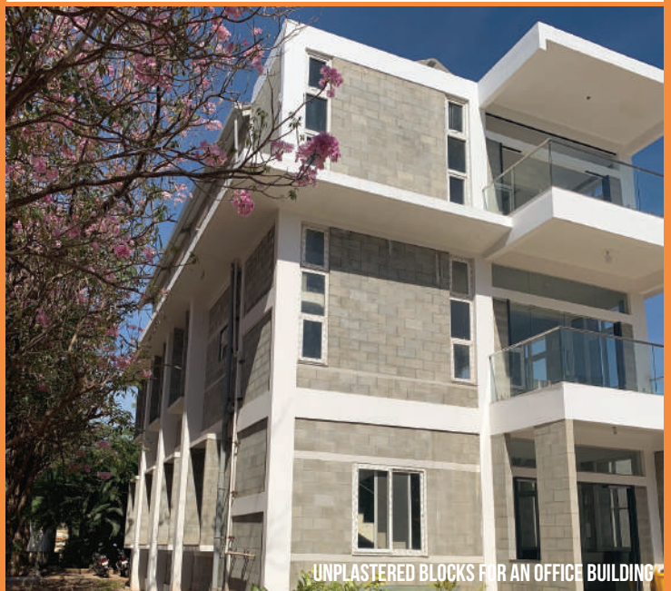
UNPLASTERED BLOCKS FOR AN OFFICE BUILDING